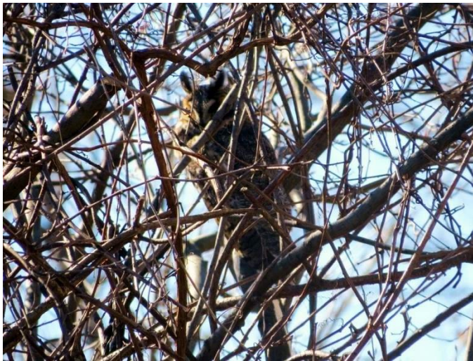
Long-eared Owl on Belle Isle