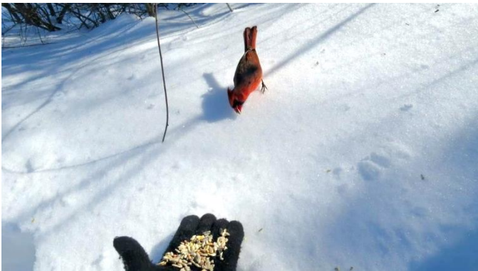
Cardinal at Kensington

Come enjoy the Kensington Metropark nature trails and continue our annual tradition of hand-feeding the birds, including chickadees, nuthatches, titmice, and others! Everybody loves to hold the birds and see them so close. Bring seed for the birds and lunch for yourself. Insider tip: they seem to